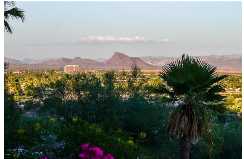
Your view of Talking Stick Resort and McDowell Mountain Range