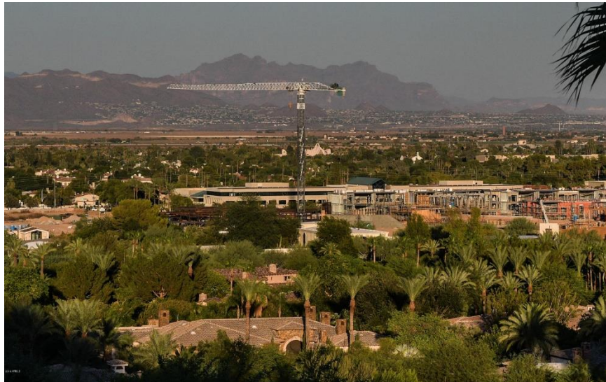
Your view overlooking the new Ritz-Carlton, Paradise Valley